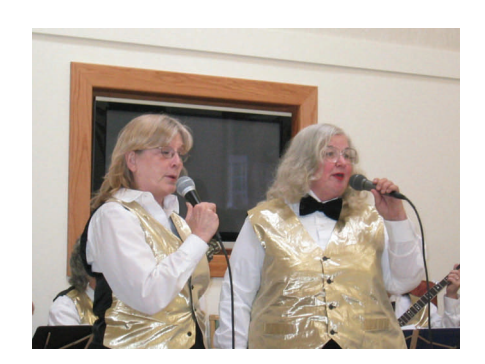
April 13 Chateau Pleasant Hill