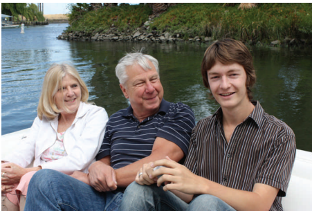
A PICTURE IS WORTH A THOUSAND WORDS

Mix grits, butter, and garlic cheese well. Pour into a buttered baking dish (8" X 13"). Topping: 1 1/2 c. crushed cornflakes (or cheezits) that has been mixed with 1/8 lb. melted butter. Spread on top of the grits mixture. Bake 45 minutes at 350 degrees.