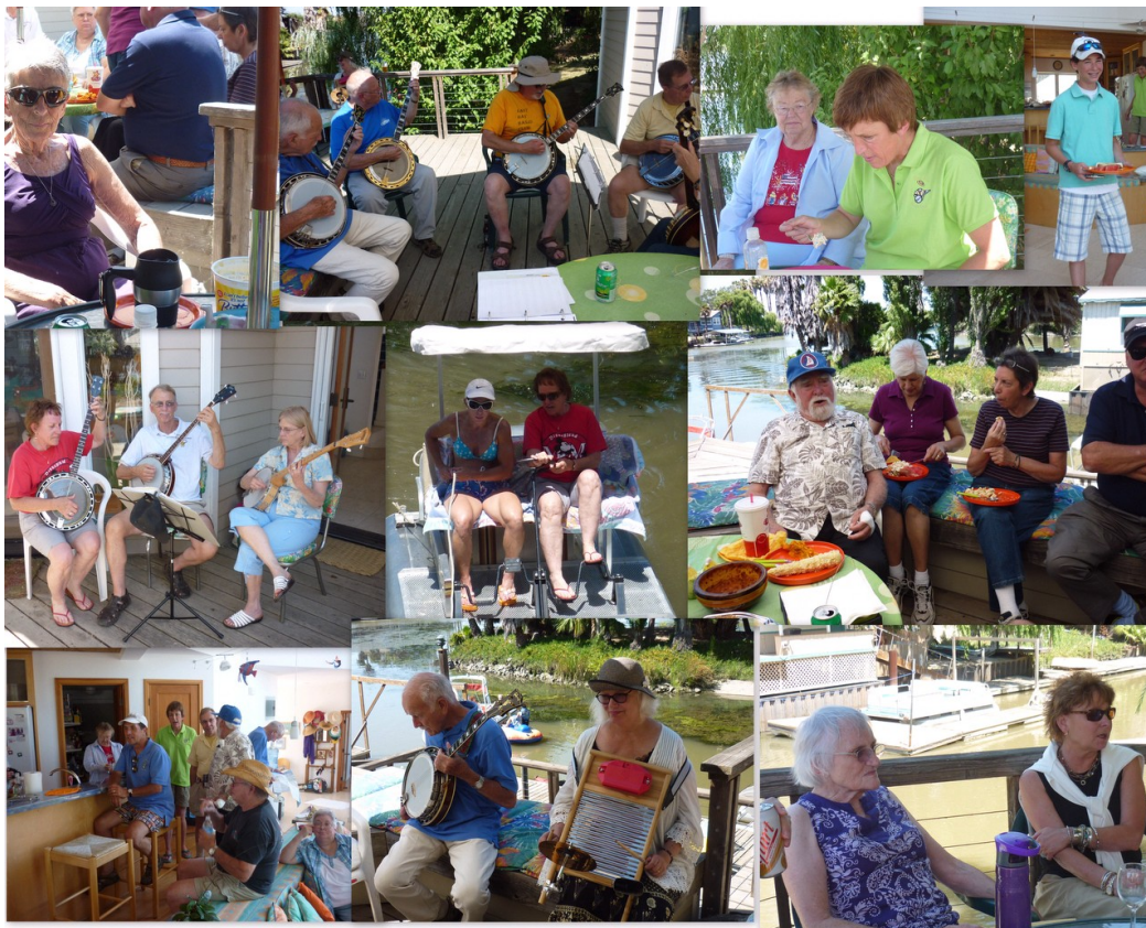
EBBC Annual Picnic Held at Landers Landing