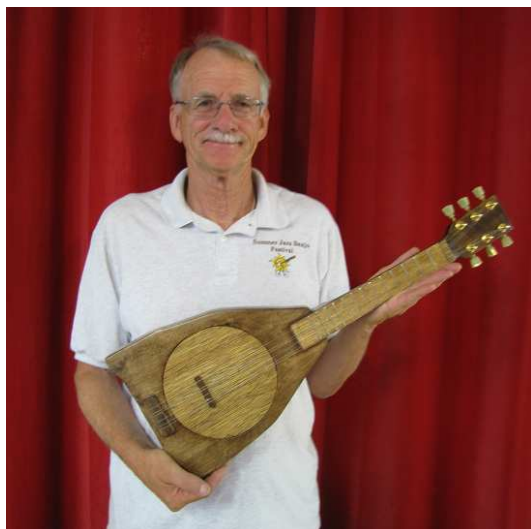
Front View of Bob's Banjo