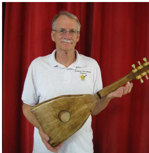
Back View of Bob's Banjo