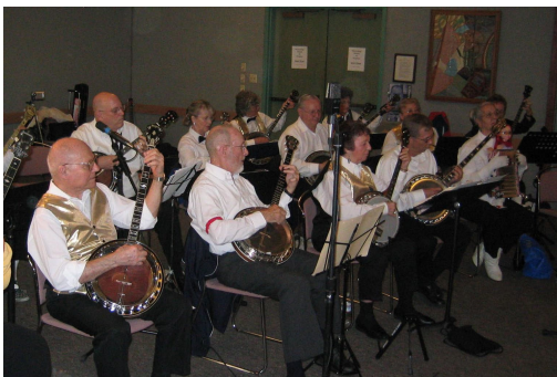
February 11, 2007 Recording Session —Some shed their vests to get down to the serious task of recording.