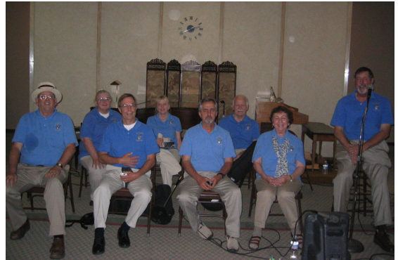
June 22, 2007 Lake Park Retirement —The performers take a rest after a well received performance.