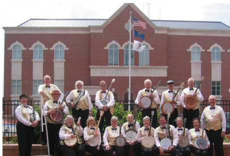
The group poses in front of the Guthrie City Hall.

To summarize, it was a fun trip, but it will definitely not be a yearly event.