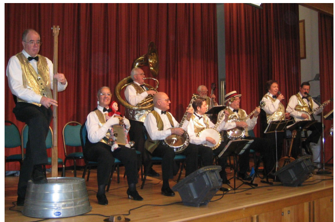
Jan 20, 2007 Masonic Crab Feed—The small , but very talented group of performers enjoyed both the performance and the fantastic crab dinner, compliments of the Masons.