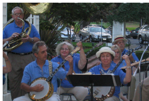
Sept 13, 2006 Piedmont Reunion—Gig ended with playing of the HS fight song. Loved it!