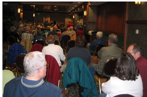
Large crowd fills the ballroom to listen to the jam session