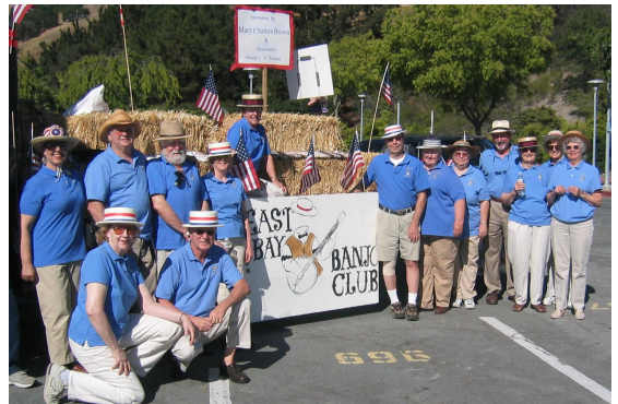
July 4, 2007 Orinda Parade —Gang ready to board the float just before "Plan B" (Bill's pick up truck). Hey! Great recovery ! A First Place ribbon to boot!