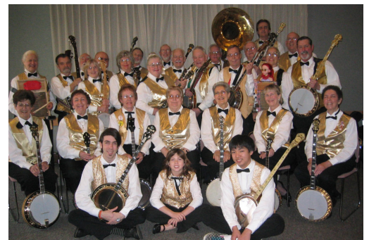
February 11, 2007 Recording Session — The whole gang poses just before the recording begins.