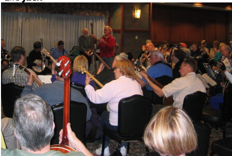
The big jam session the second night of the trip.