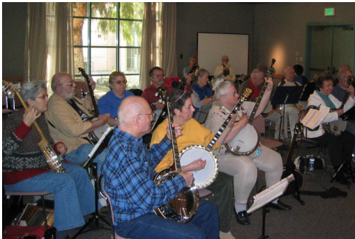
Jan 21, 2007 Final Rehearsal — We played each song over and over again!