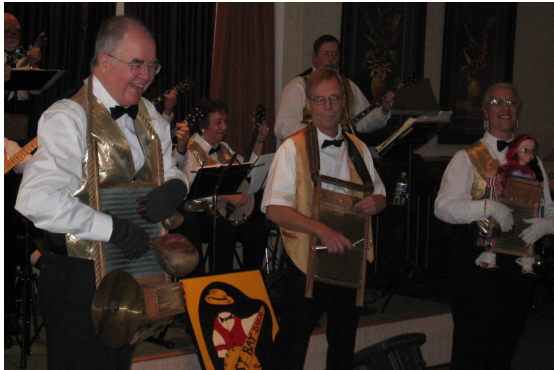
April 14, 2007 Chateau III —Our washboard trio made great merriment for a full audience of seniors.