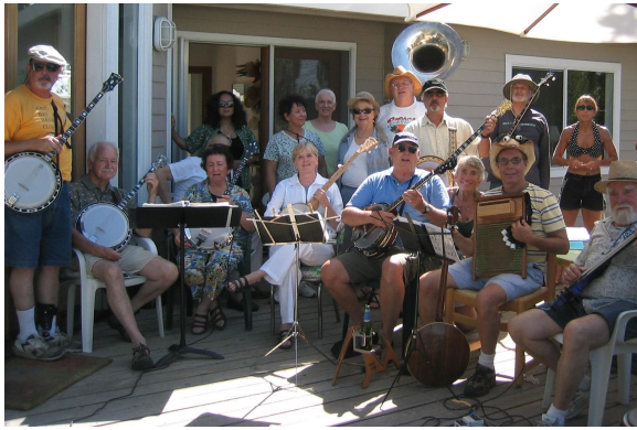
Aug 25, 2007 Summer Picnic —We all jam on the deck at Lander’s Landing on the Delta. Great food! Great fun!