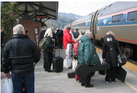
Train arrives in Martinez for boarding.