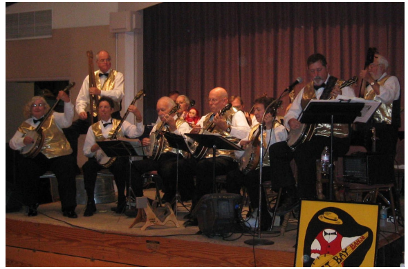
Sept 16, 2007 Lafayette/Orinda Presbyterian Church —A tiny stage made us perform in close quarters.