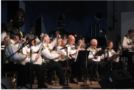
Feb 25, 2007 Banjo-Rama —This performance went very smoothly because of all the practicing for our new CD.