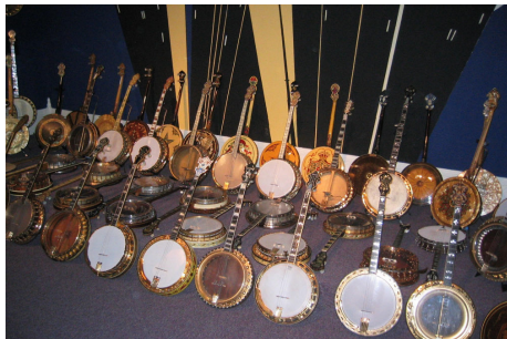
Part of the banjo collection at the museum.