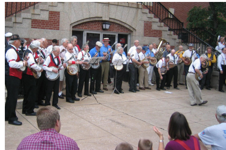
The "largest banjo band in the world"? Note quite.