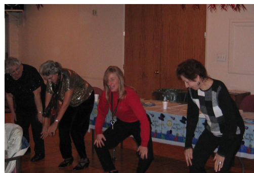
Dec 31, 2006 New Years Eve Party—Audience inspired to dance the "Charleston".