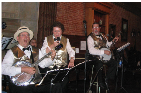
Singing "Clementine" for our final gig at the Granny Had One restaurant .They loved it!