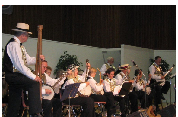
Oct 20, 2007 California Club Annual Brunch —Great audience response to our “California” play list. The gig has become a annual event enjoyed by all.