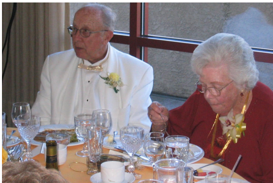
May 5, 2007 50th Wedding Anniversary —The happy couple enjoys dinner while we perform for a large number of guests. Our complimentary dinner was fantastic!