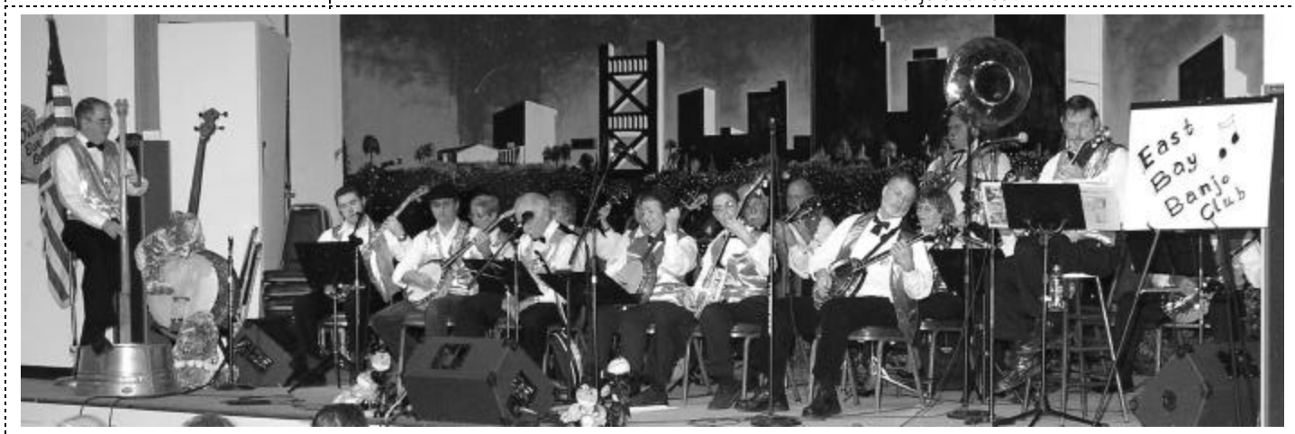
EBBC on stage at the Banjo-Rama 2004