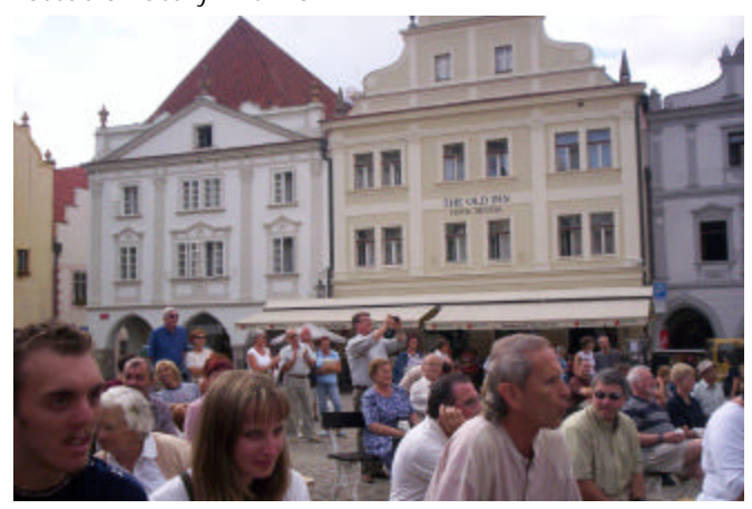
Crowd of on-lookers at Ceský Krumlov town square