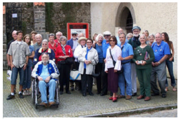
The whole gang on the tour of Tábor