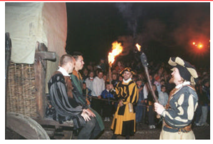
Torchlight parade Friday night