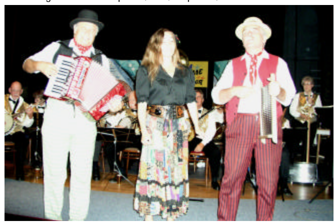
Our Czech hosts share stage in Tábor Opera House