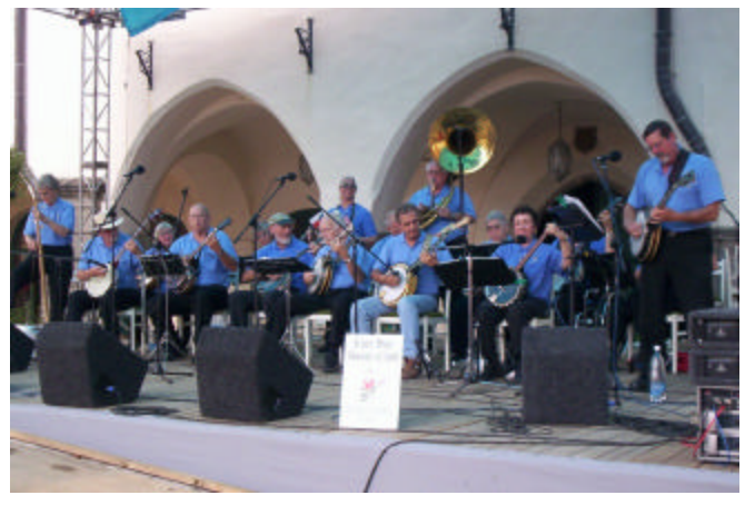
On stage at the Ceský Krumlov town square