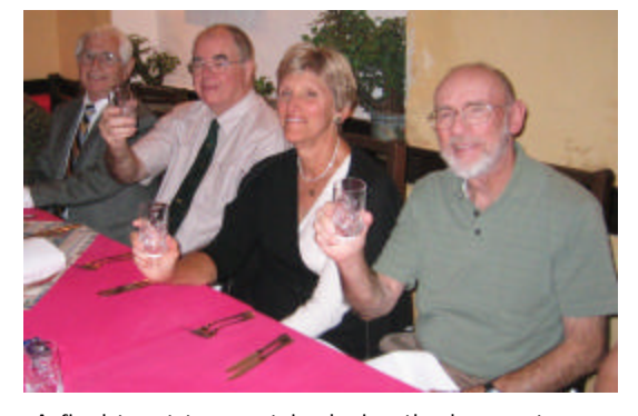
A final toast to our trip during the banquet