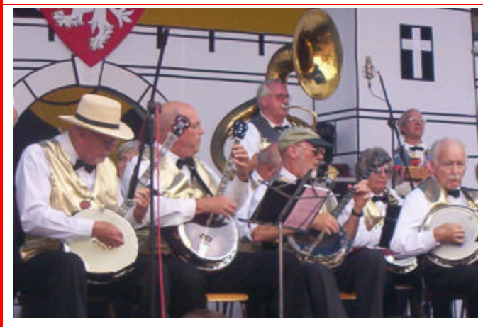
On stage in Žižka Square, Sat, Sept 10, 2005