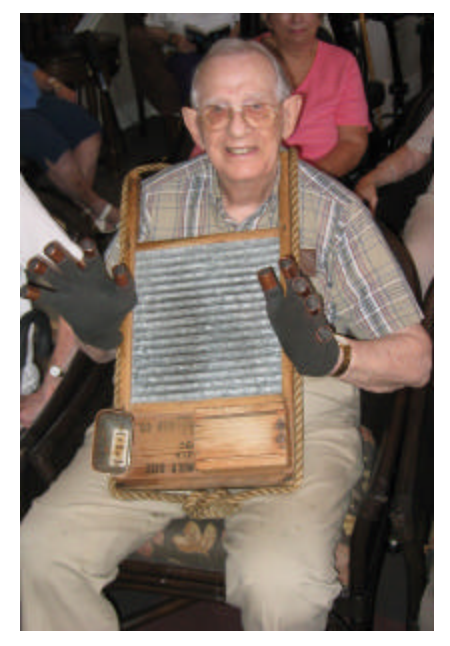
On-looker inspired to play washboard